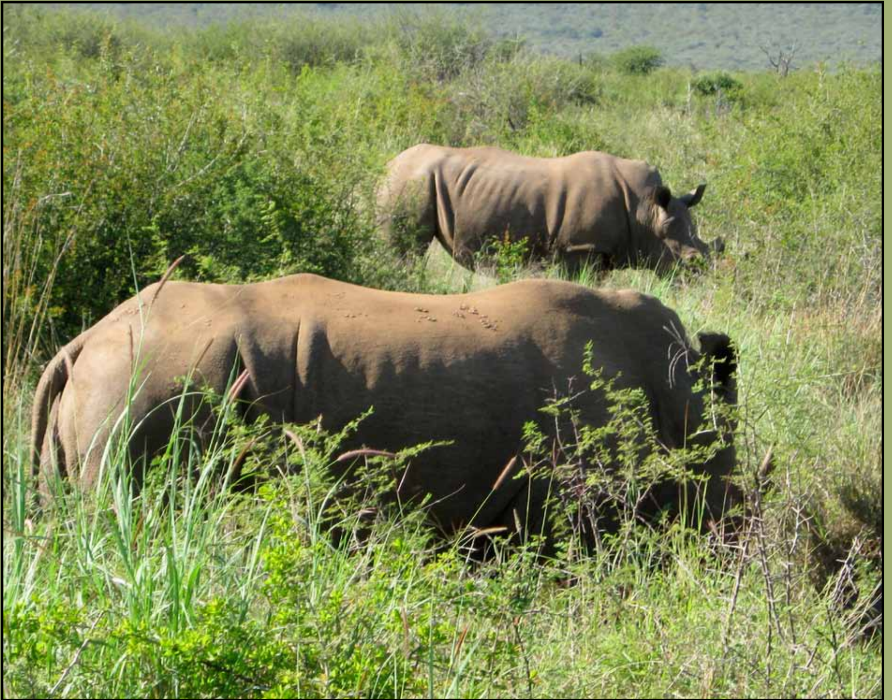
The Bruise Brothers of white rhino fame.