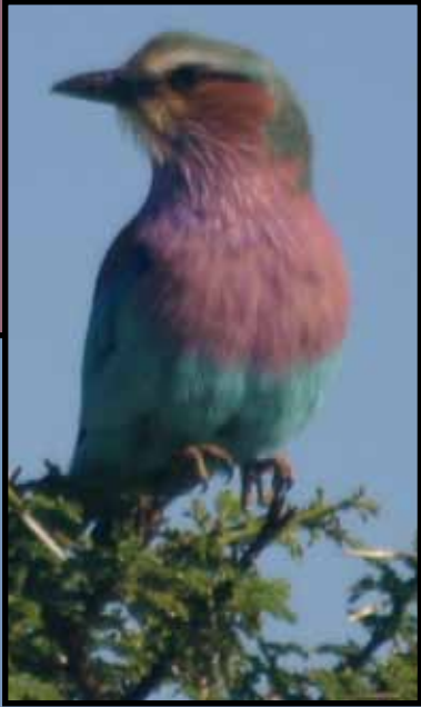
The lilac-breasted roller.