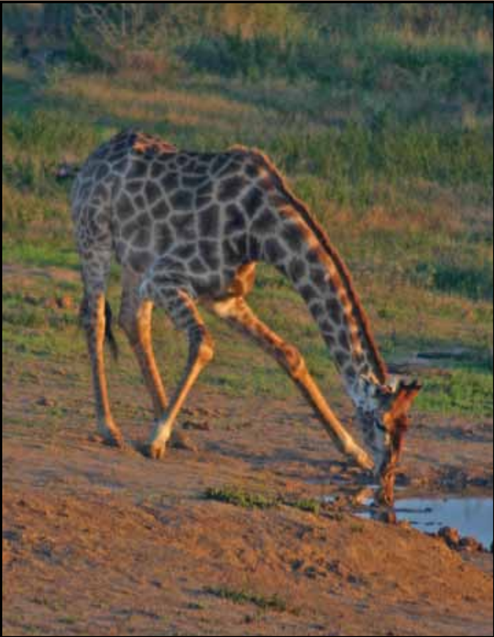
Giraffes at a water hole at sunset.