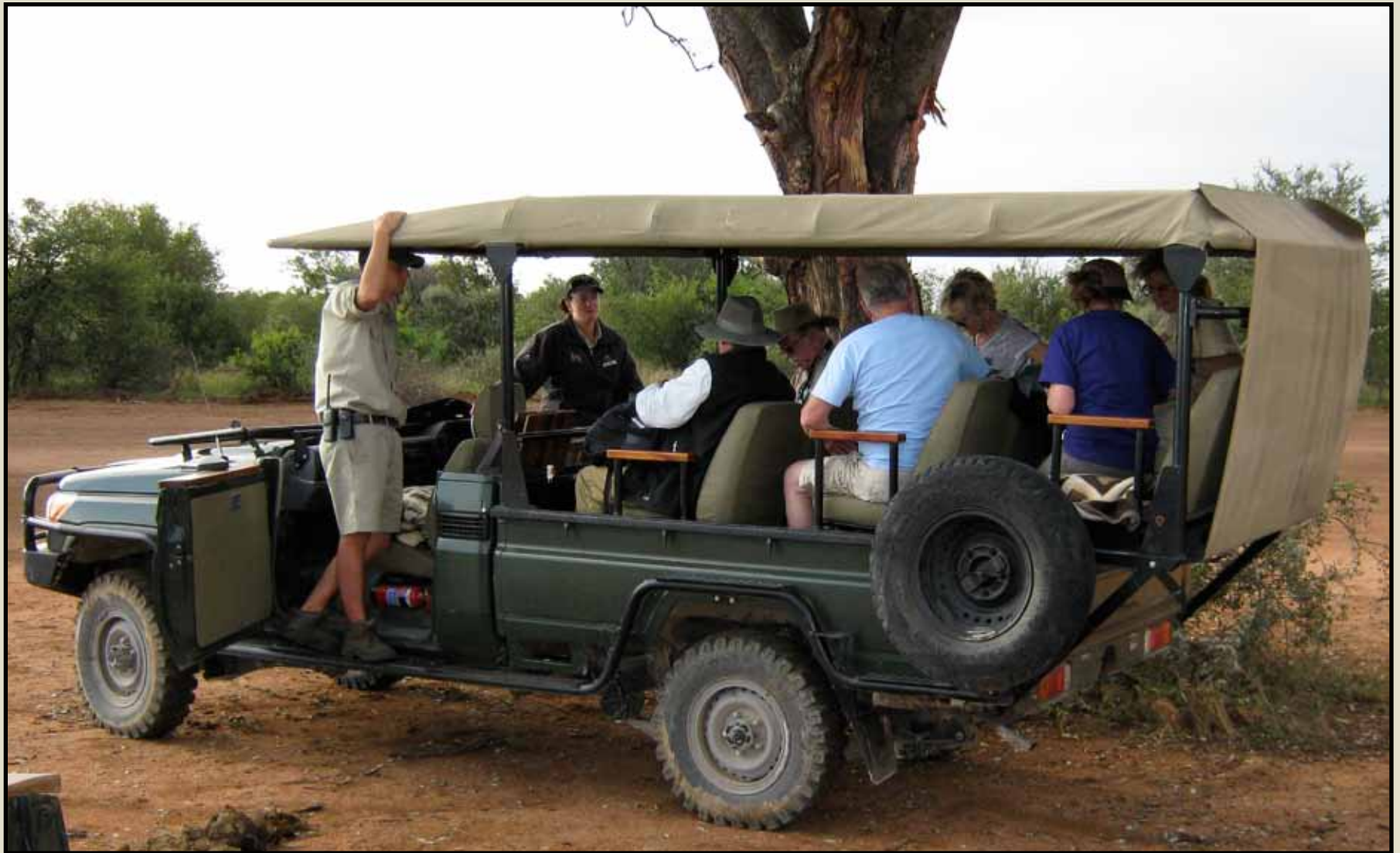
Our game drive chariots (notice the rifle on the dash).