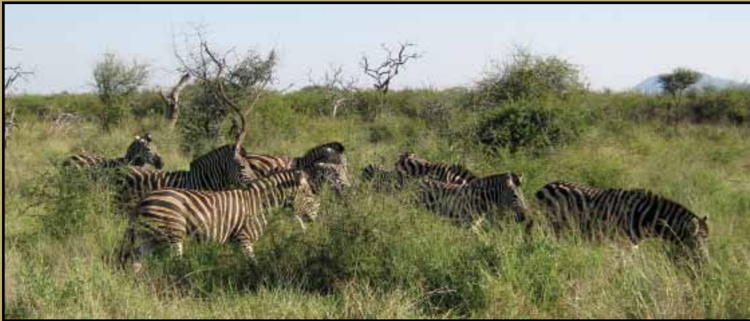
A dazzle of zebra in the tall grass of the bush.