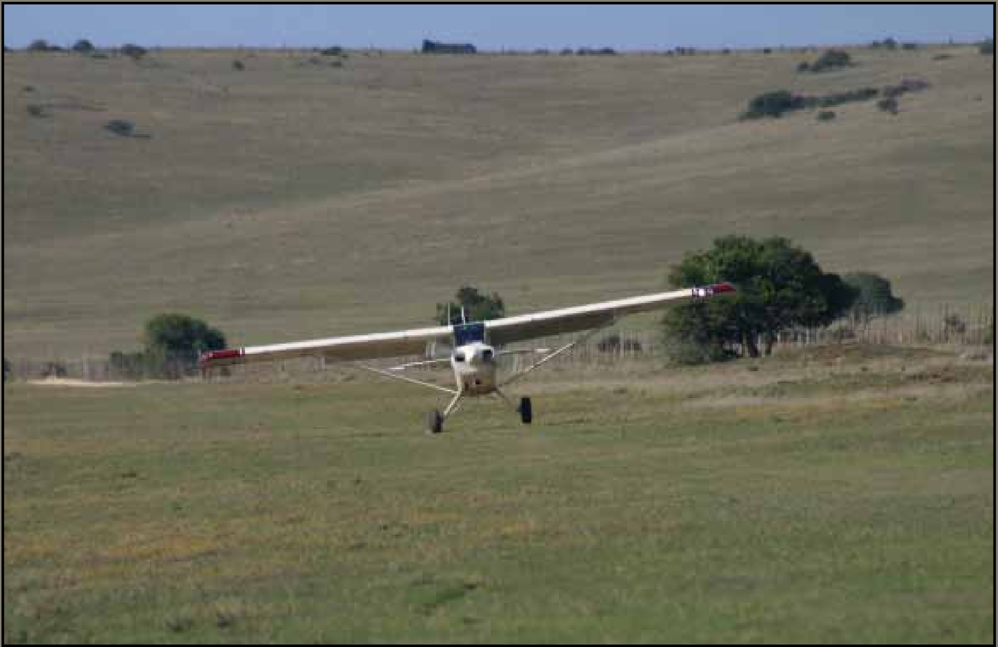
One of our Huskies landing on the private grass strip at Gorah.