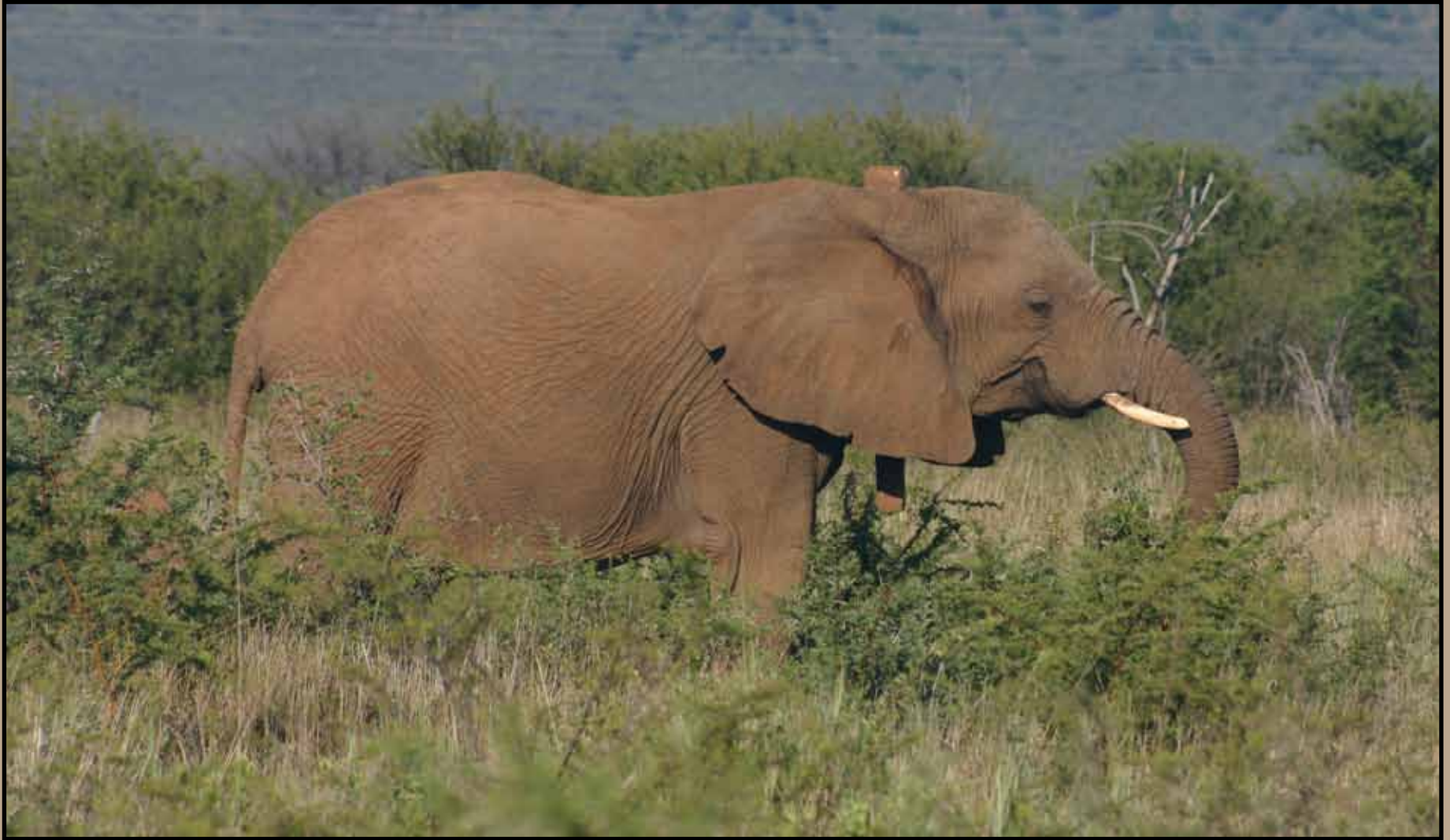
A mama elephant just passing by.