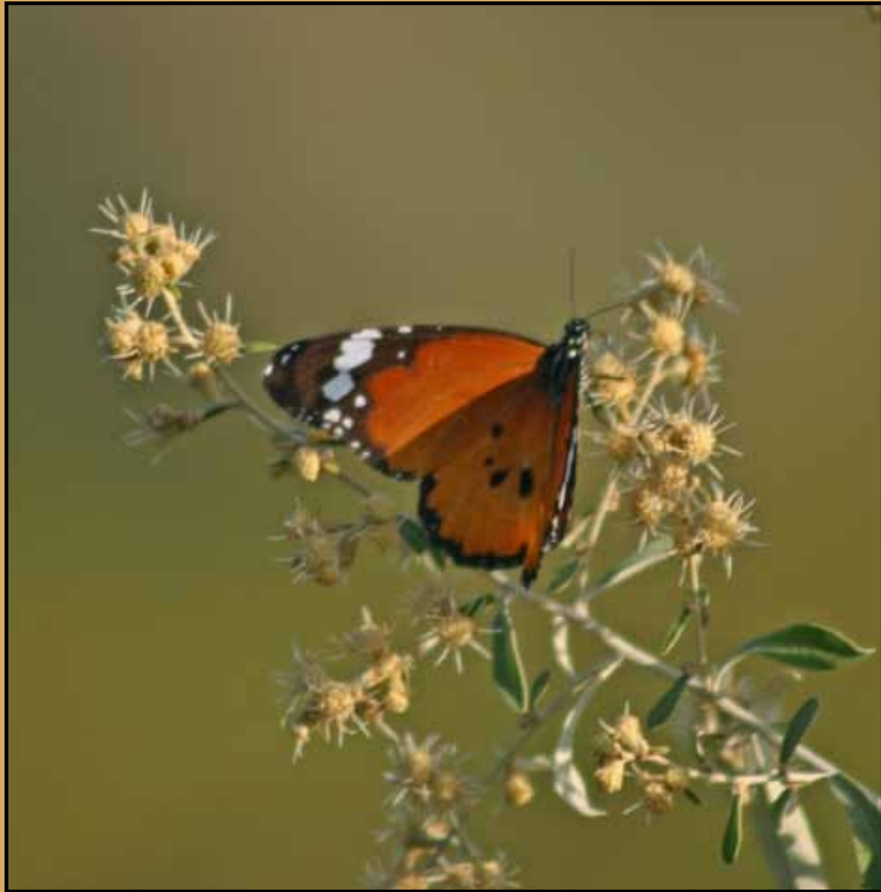
An African Monarch butterfly.