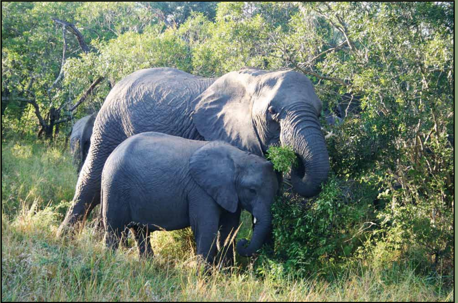
Baby gets some coaching in decimating a tree.