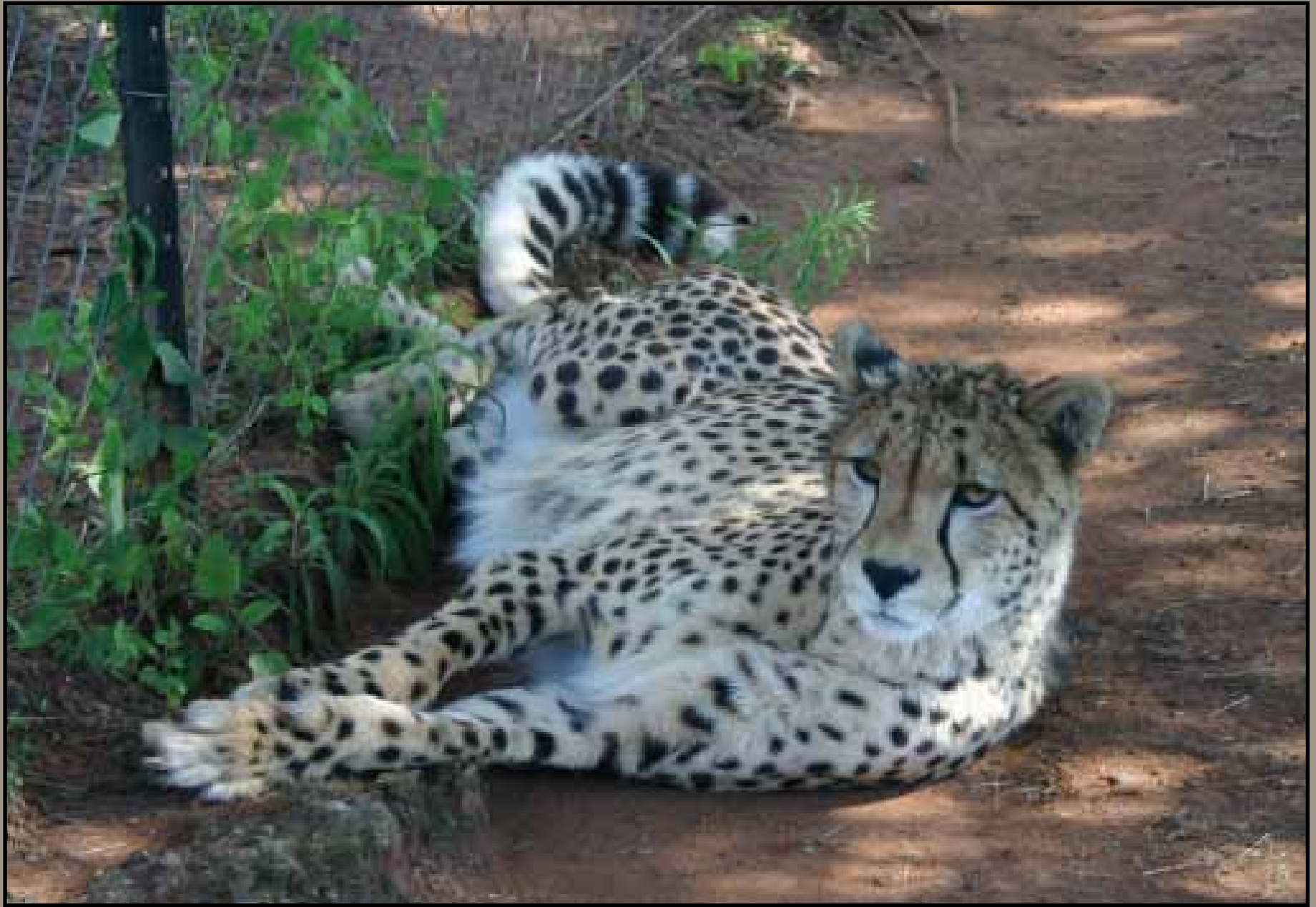
One of the preserve's ambassador cheetahs.