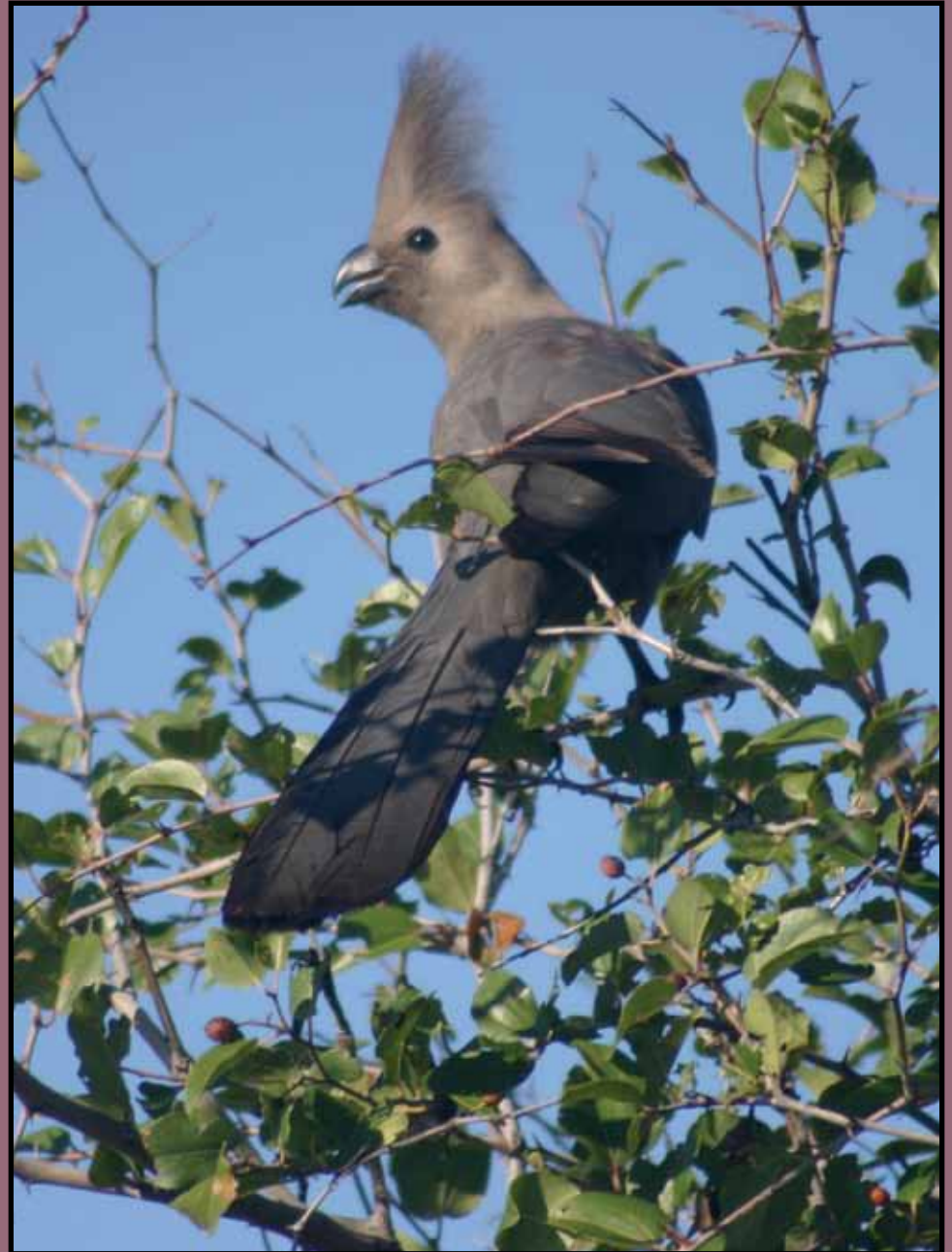
The “go away” bird.