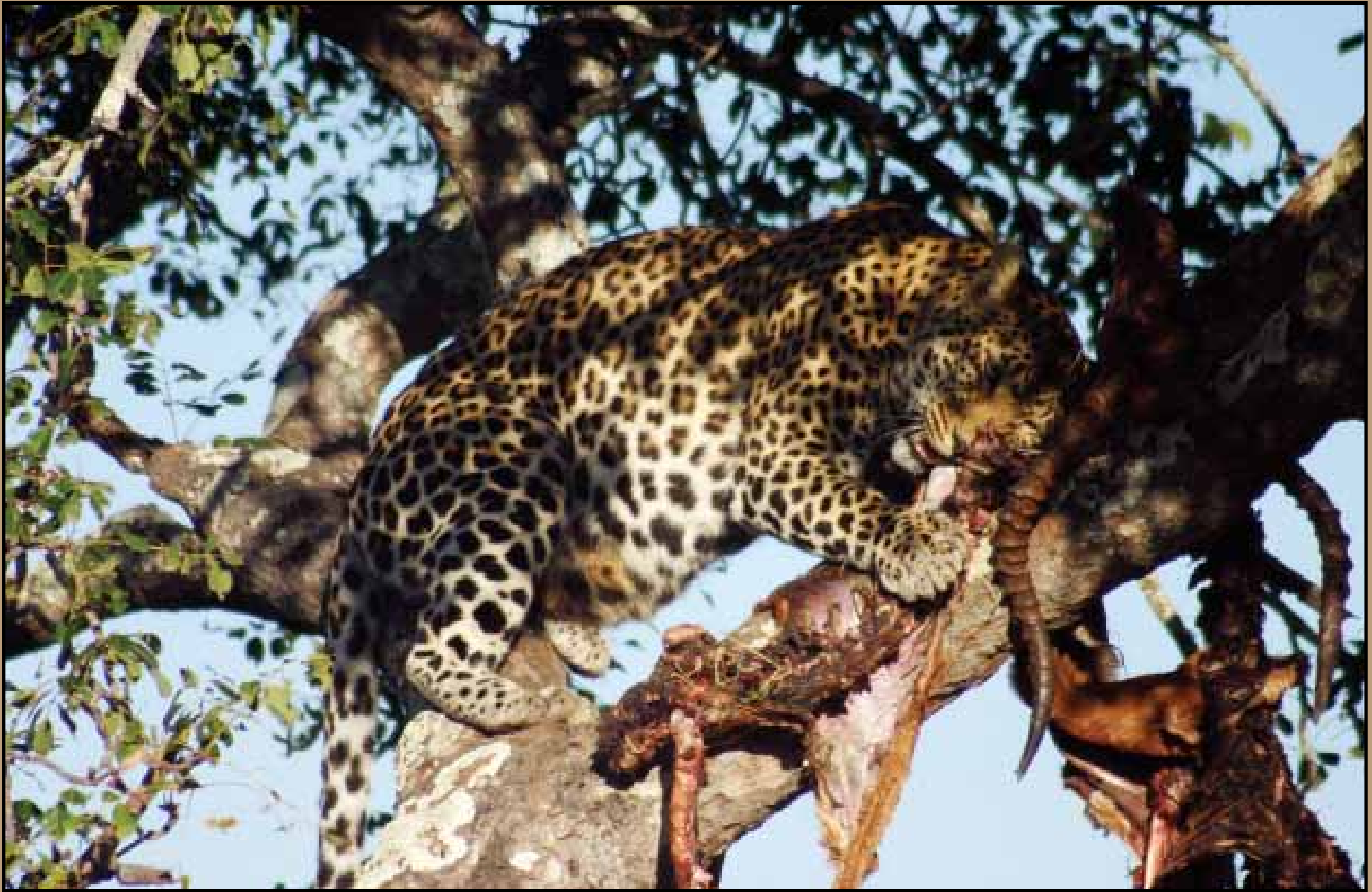
She munched on this impala kill, which she dragged up the tree, for three days.