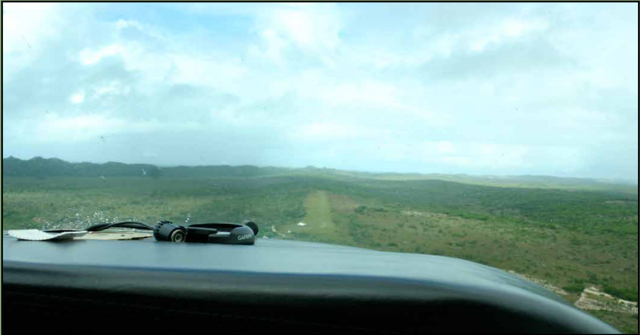
On final approach at the Pomene airstrip after coming through squalls.