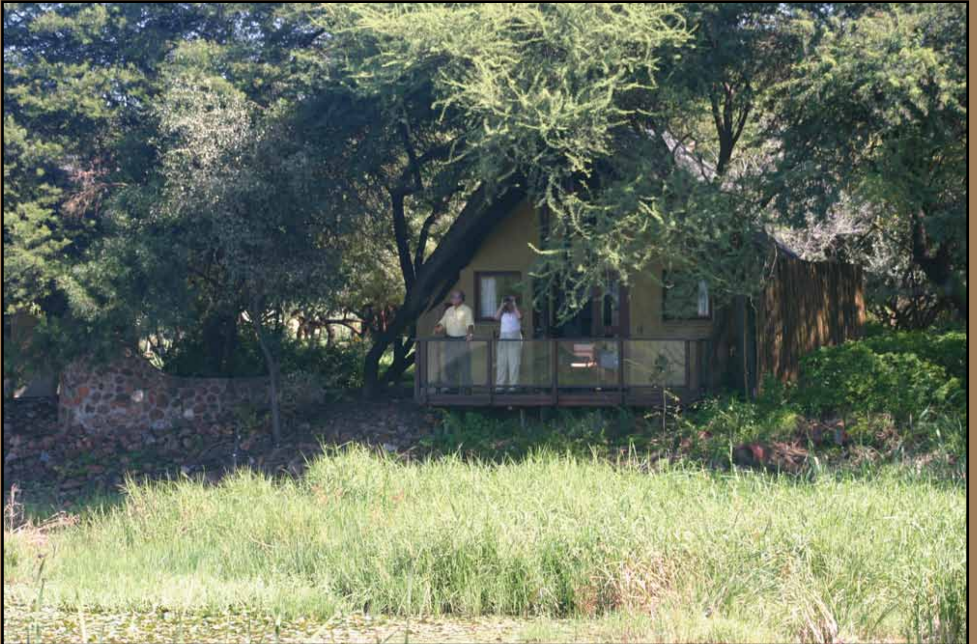
A neighboring cabin at Tau Game Lodge.