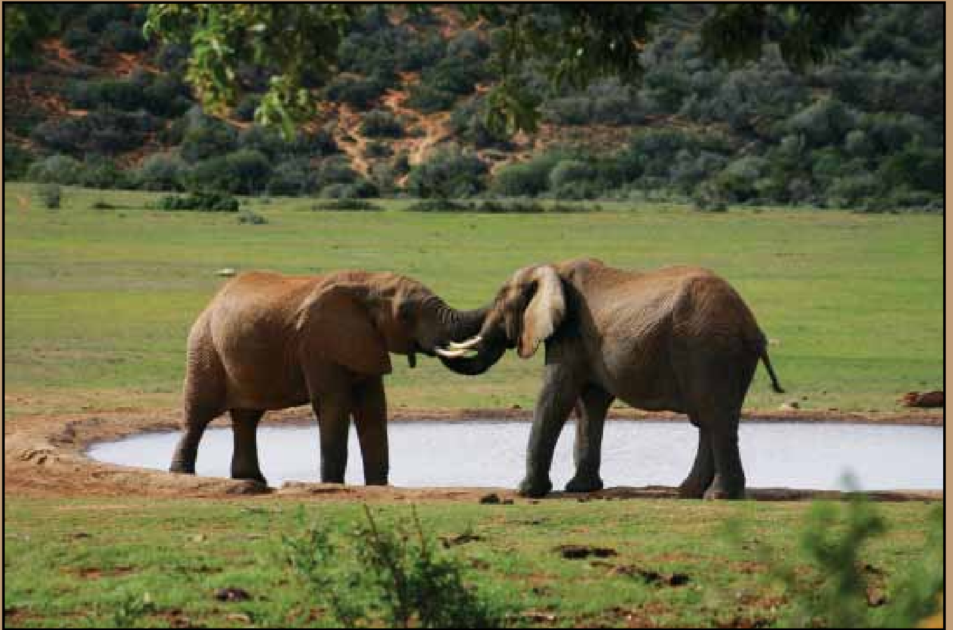
An elephant pas de deux right outside the lodge at Gorah.