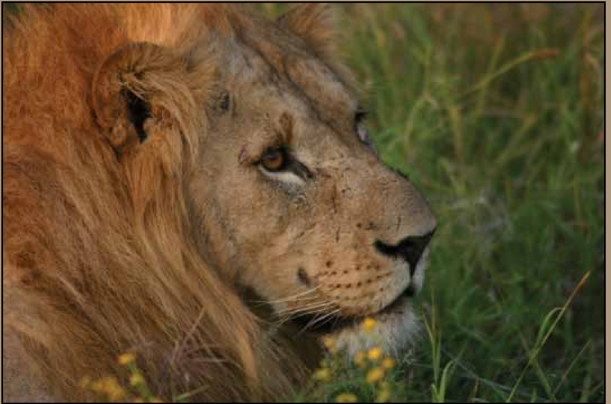
One of two bachelor brother lions at Madikwe after a meal.