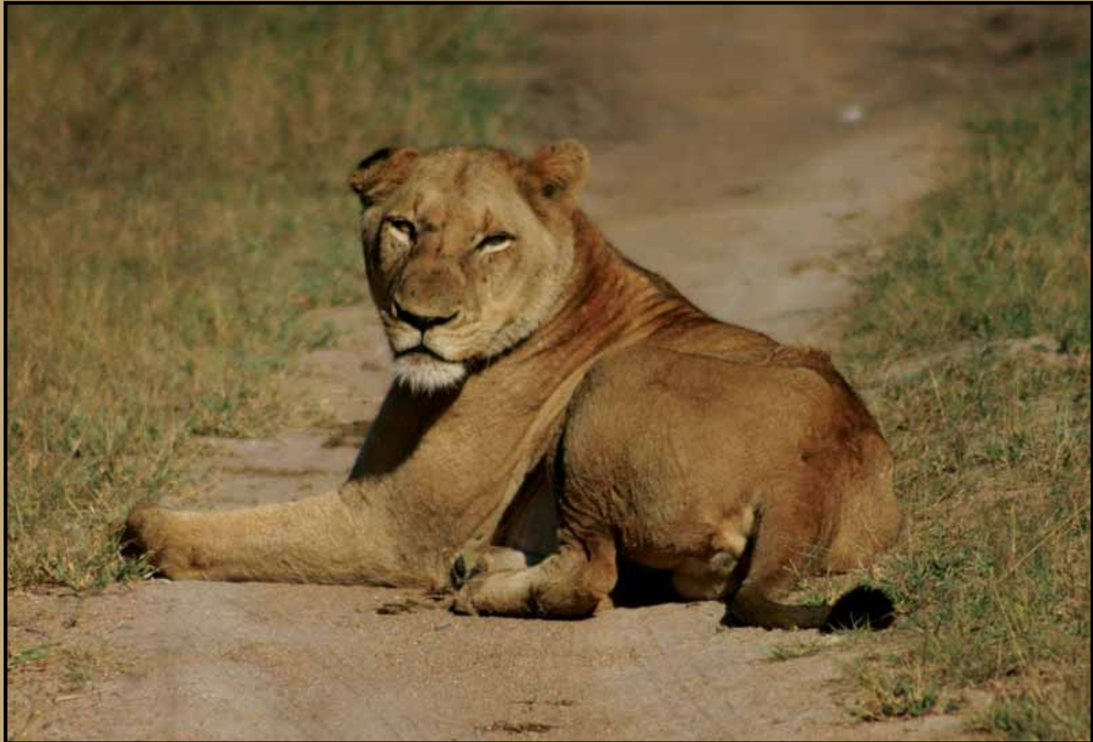
A lioness called Floppy Ear rests after a kill.