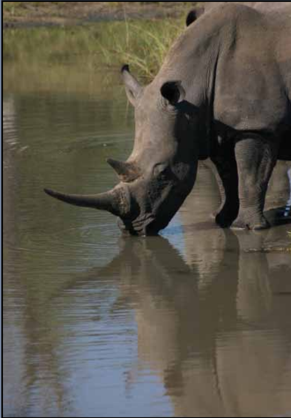
Rhino pauses for a drink.