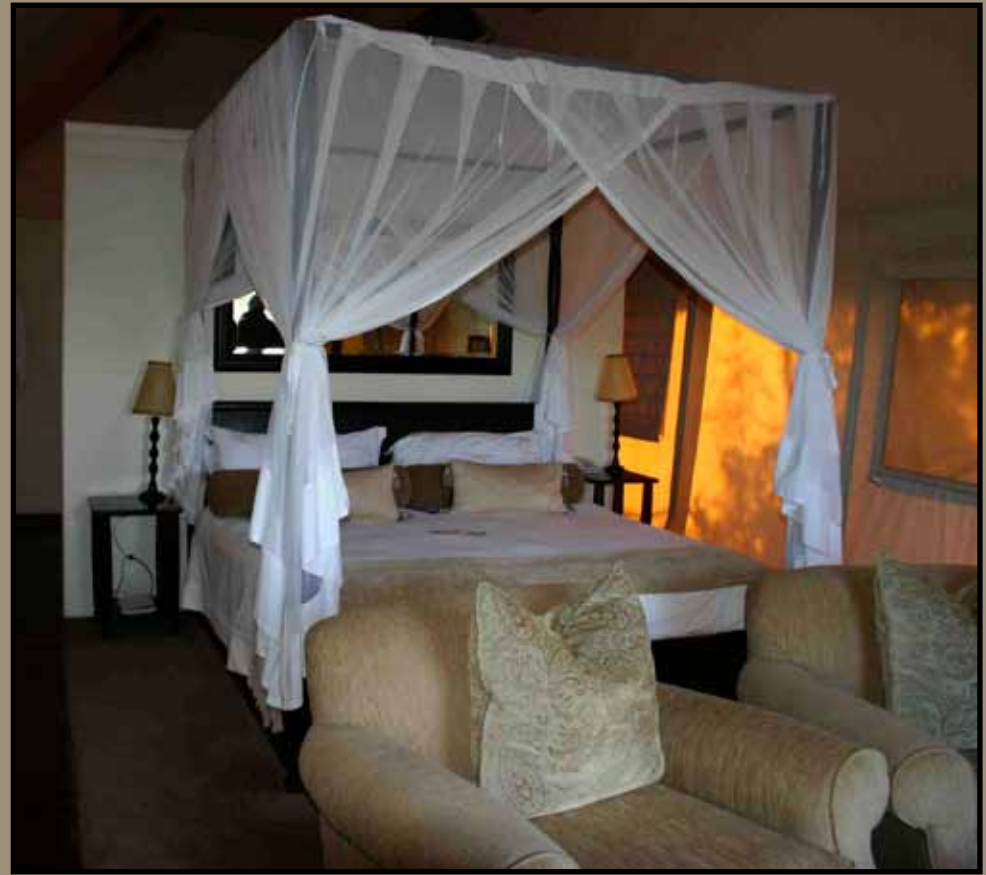
A visiting hartebeest at the veranda and our “tent” at Gorah.