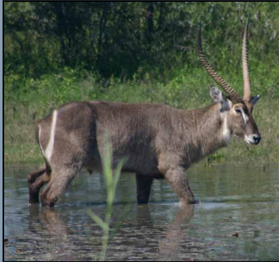
A water buck in the pond in front of our cabin at Tau Lodge.