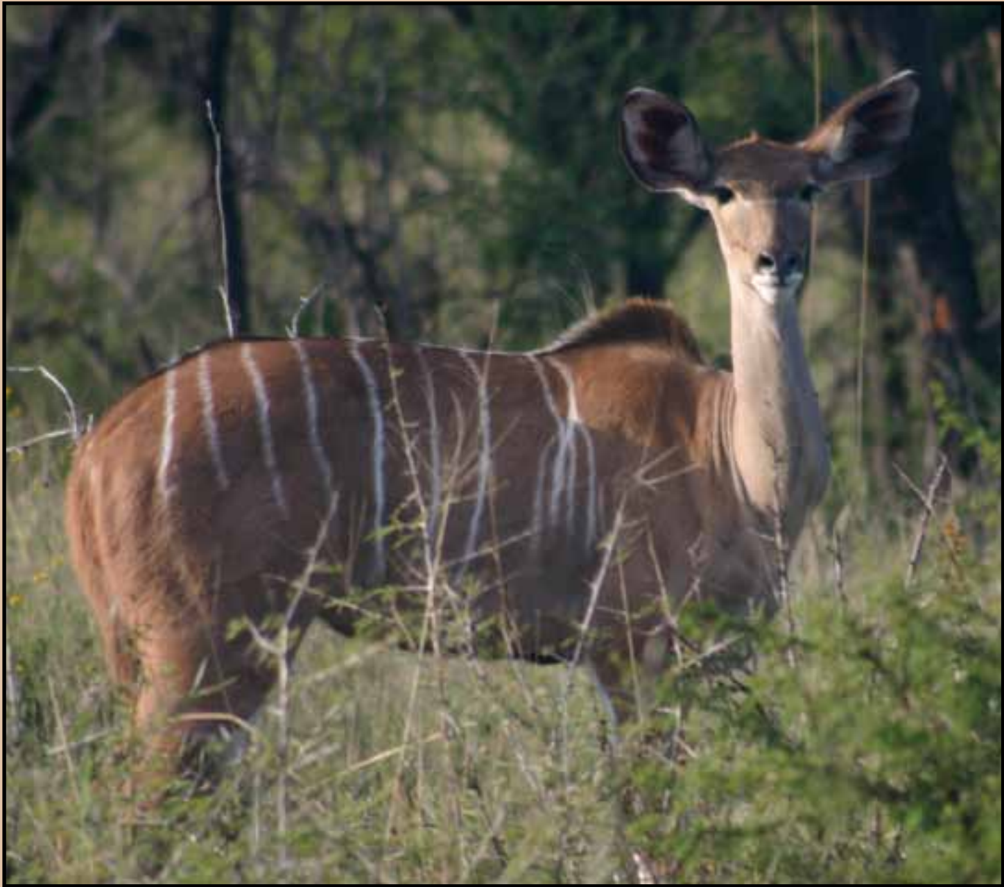
A female kudu in the Madikwe bush.