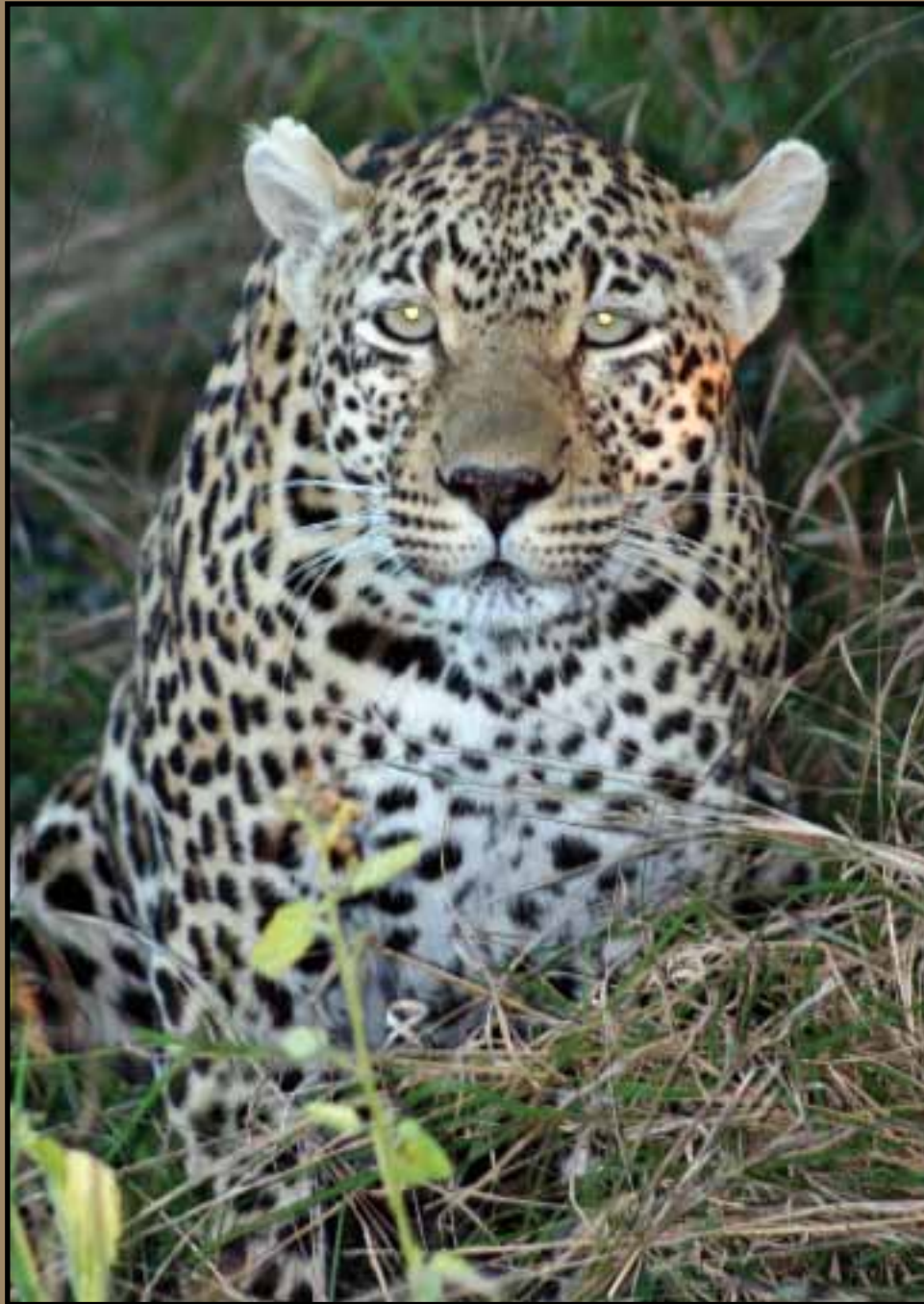
Our first leopard!