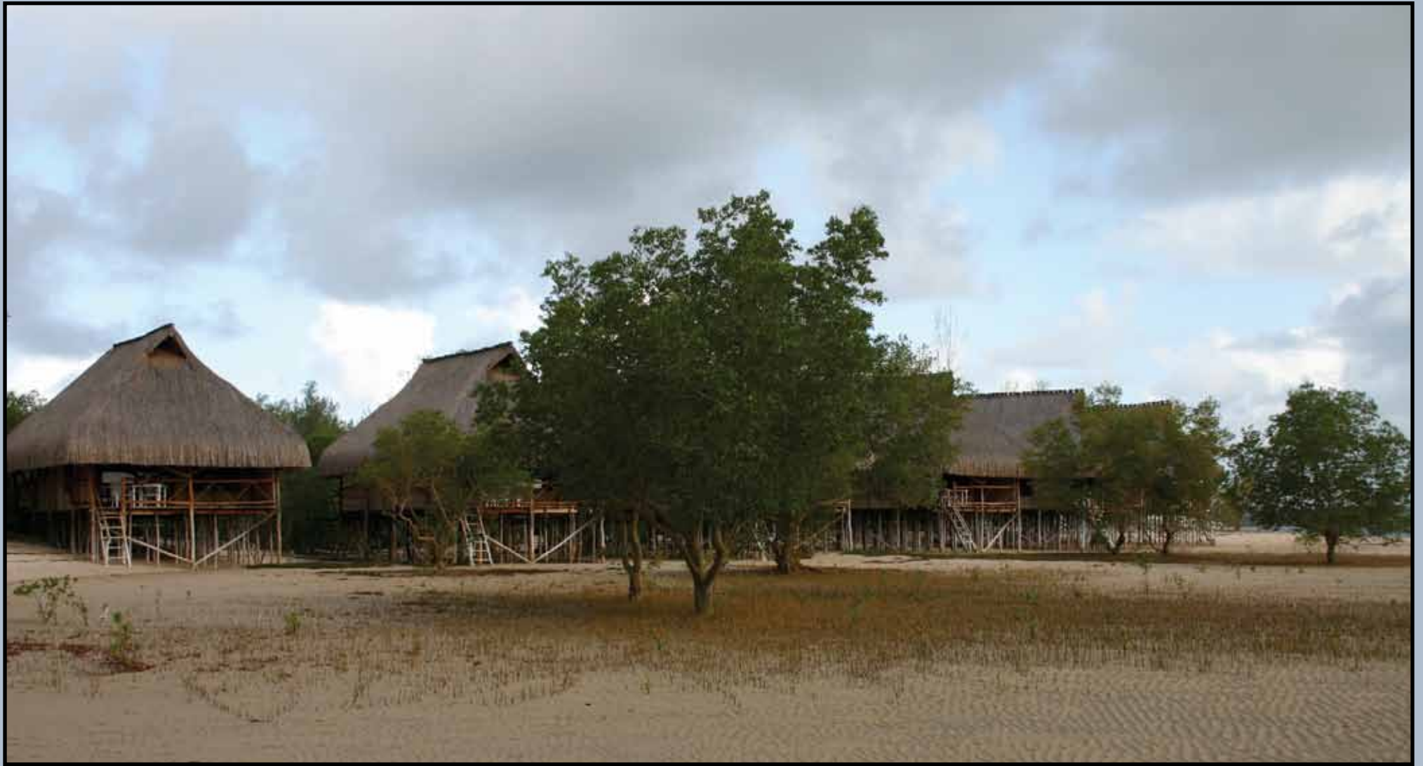
The huts at Pomene Lodge on the estuary.